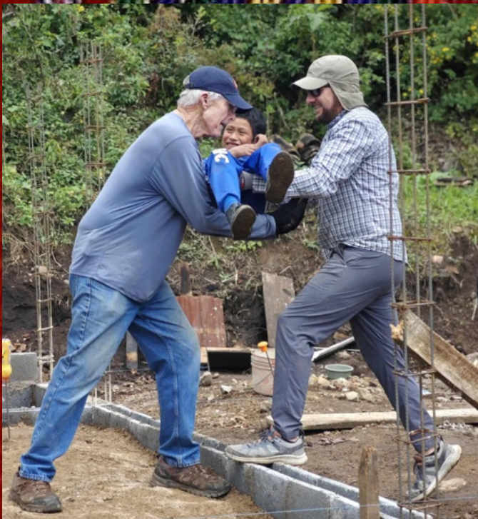
We want to express our gratitude for the hard work of Porch's staff in Guatemala. God has blessed Porch and our families by providing for years of ministry through the generosity of our partner churches, mission partners, and supporters. The work of Porch de Salomon is only possible because of your generous financial contributions.