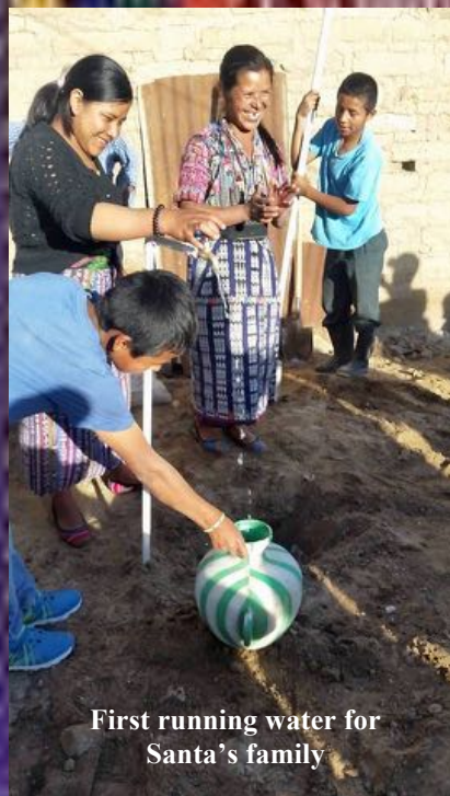
First running water for Santa’s family

We invite you to review the giving opportunities in this issue. Please contact us with your “Yes!” Gracias!!