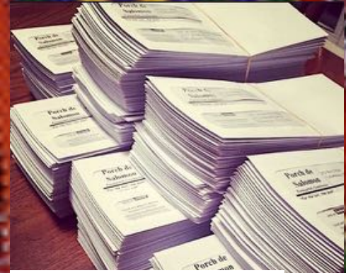
(Below) 2020 donation tax-receipt letters have been mailed, thanks to our volunteer treasurer, Robin.