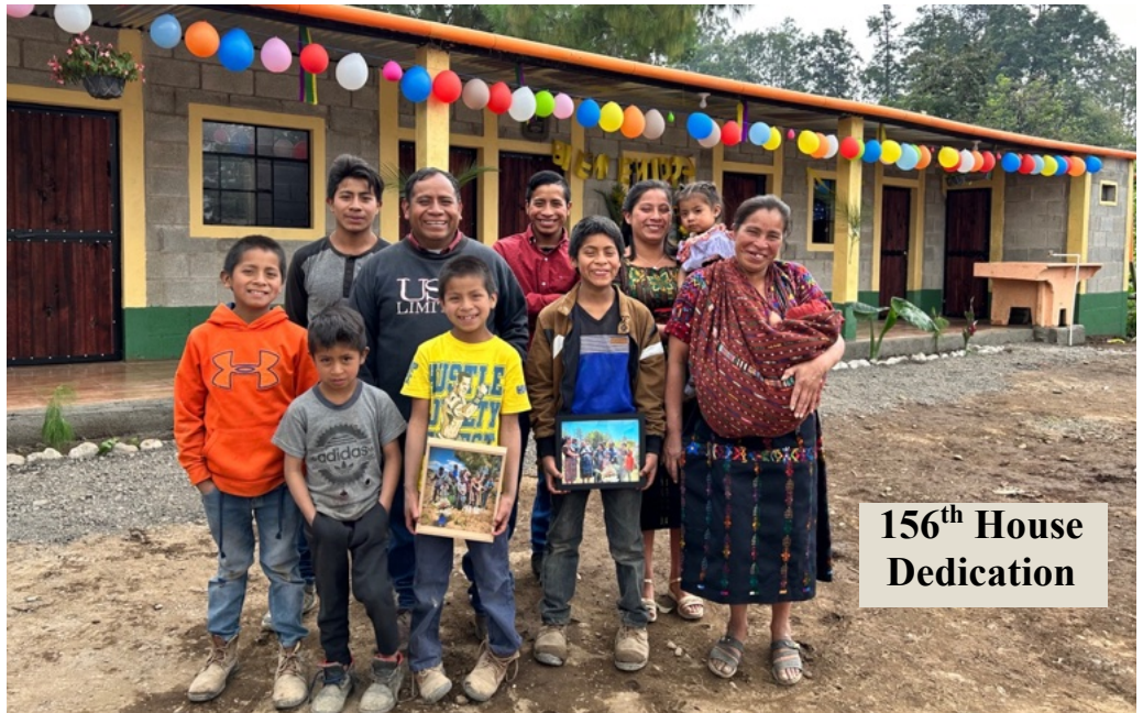
156 th House Dedication

“Praise be to the God and Father of our Lord Jesus Christ, the Father of compassion and the God of all comfort, who comforts us in all our troubles, so that we can comfort those in any trouble with the comfort we ourselves receive from God.” — 2 Corinthians 1:3-4 (NIV)