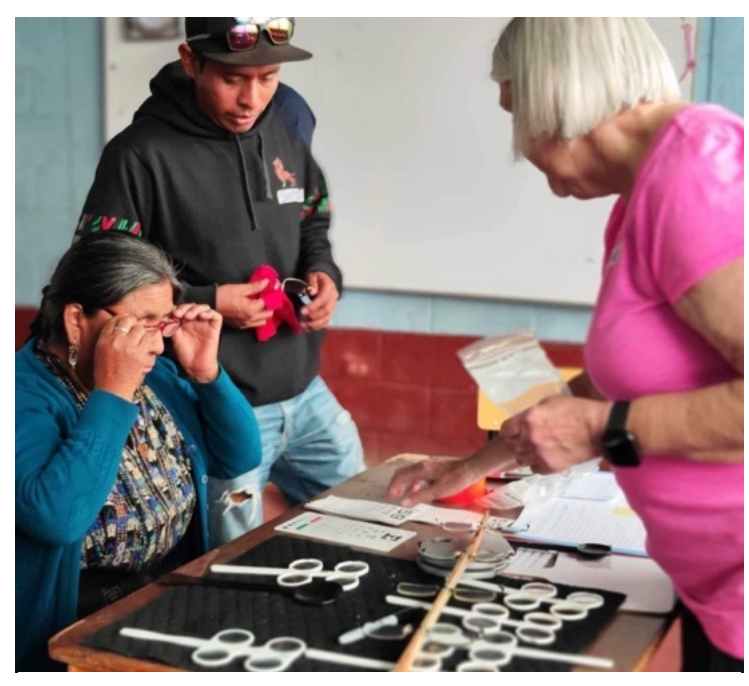
The doctors and pharmacists served approximately 480 patients, the dentists helped relieve the tooth pain of roughly 200 patients, and the vision clinic improved the vision of approximately 200 people. Gracias!