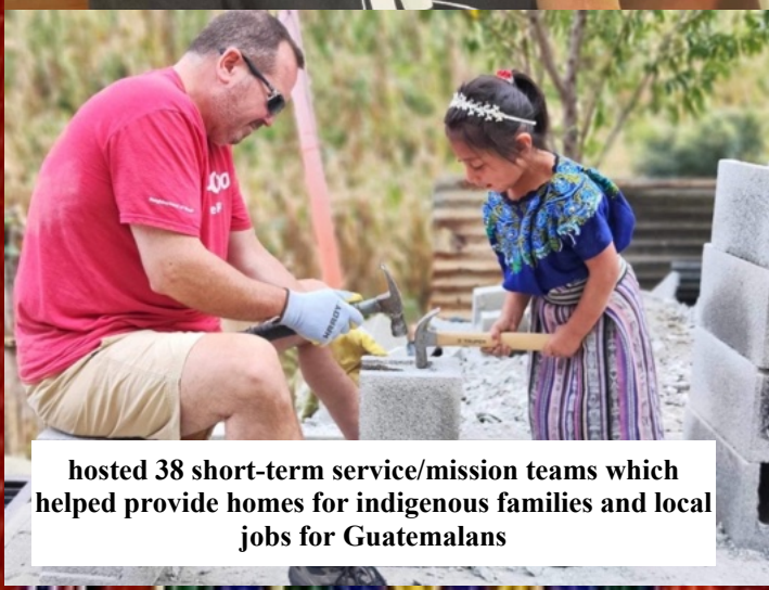
hosted 38 short-term service/mission teams which helped provide homes for indigenous families and local jobs for Guatemalans