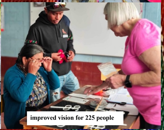
improved vision for 225 people