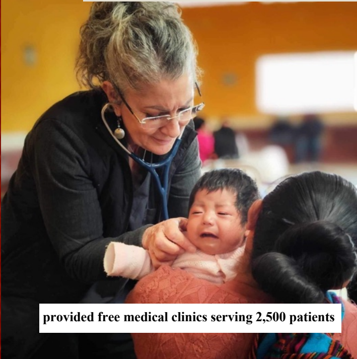
provided free medical clinics serving 2,500 patients