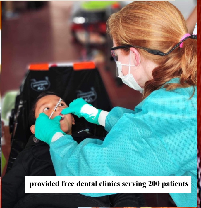
provided free dental clinics serving 200 patients