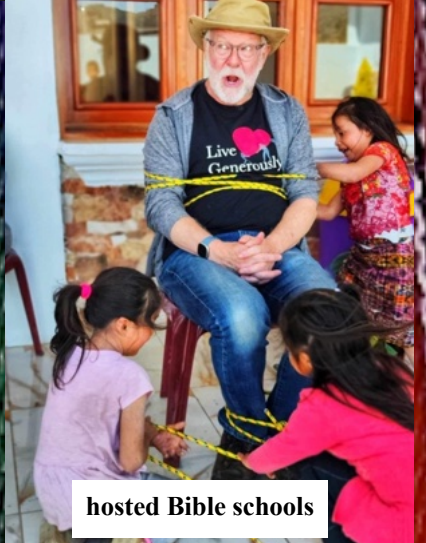
hosted Bible schools

We are grateful to God for His provisions. We thank our volunteers, staff, and mission partners for their support and dedication. Your generous donations have enabled us to provide our services for 19 years. Thank you for your continued support!