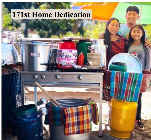
171st Home Dedication