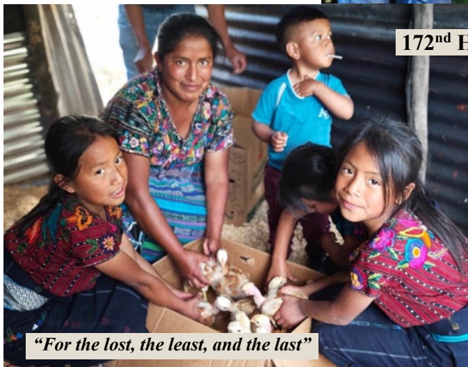
172nd Home Dedication

The family is deeply grateful for the fresh start offered by their new home, the launch of their new chicken business, and the addition of a young bull to their growing livelihood.