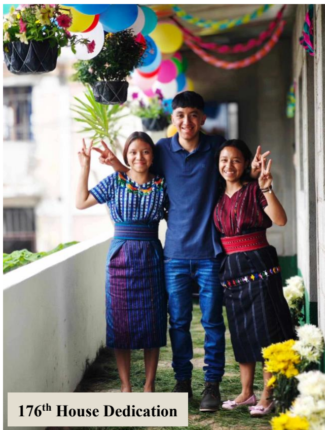
176 th House Dedication